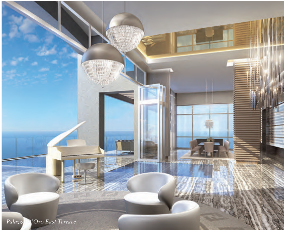
Palazzo d'Oro East Terrace