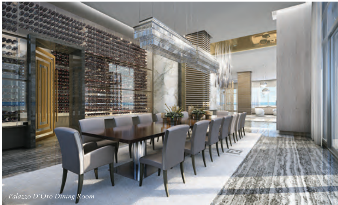
Palazzo D'Oro Dining Room